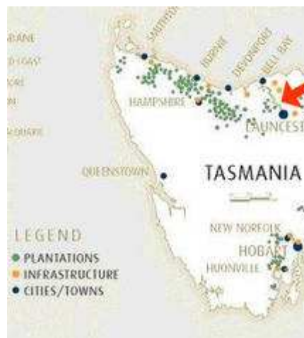
The arrow indicates the proposed local pulp plant.