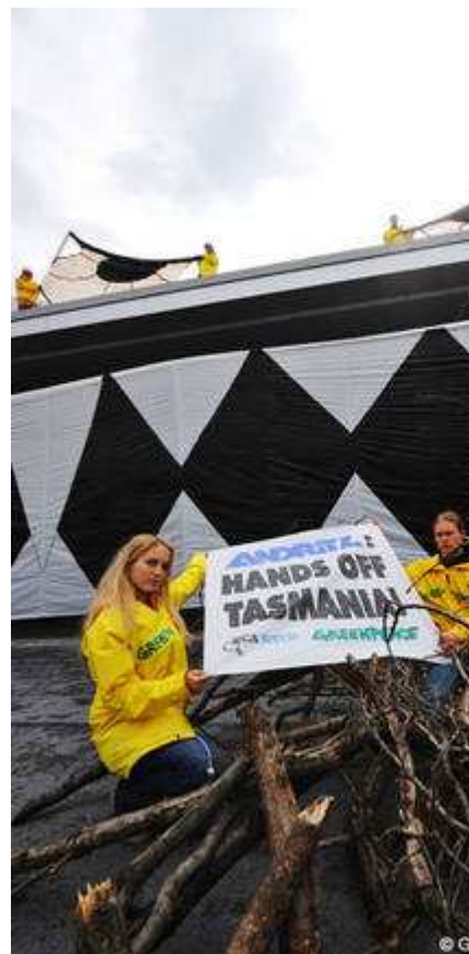
The wood-eating monster in front of the main entrance.